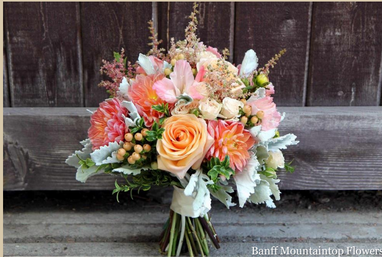
Banff Mountaintop Flowers