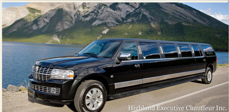
Highland Executive Chauffeur Inc.